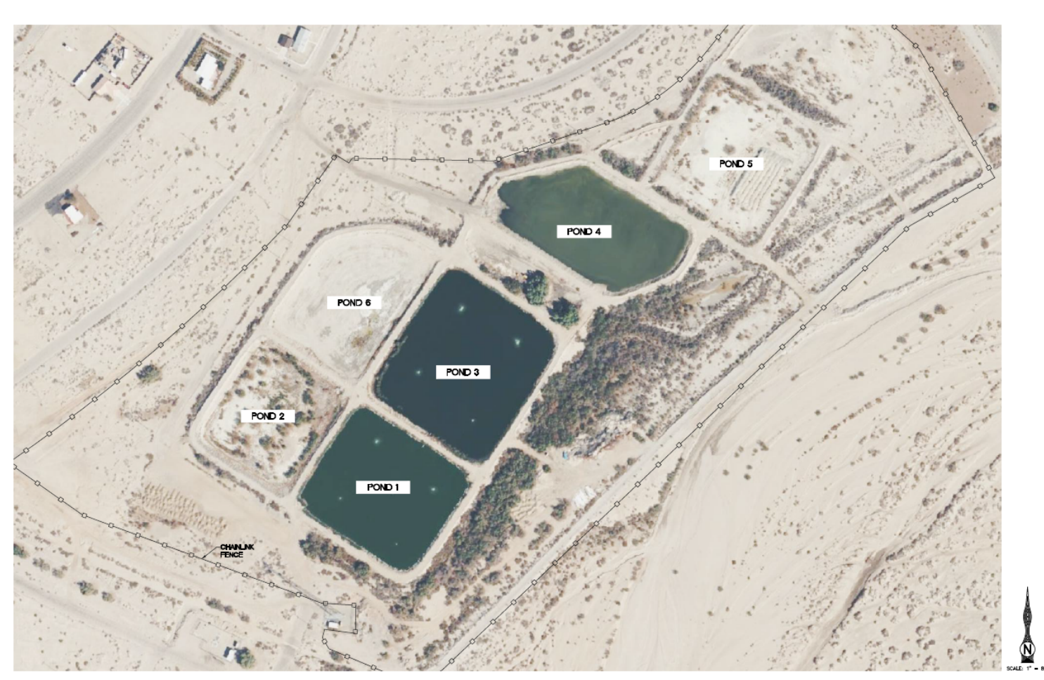
Figure 2. Site Plan